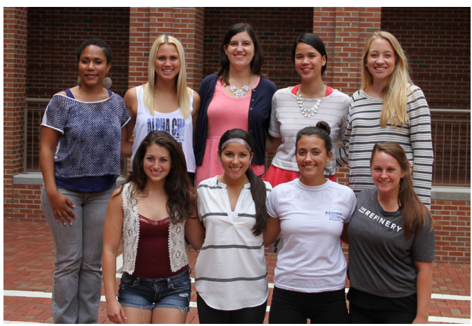
Body Project Facilitators, 2014

• Disseminating the Body Project, an evidenced-based body image program designed to help college women resist cultural pressures to conform to the thinideal standard of female beauty. Nearly 100 FSU students have completed the 4-hour peer based program this semester